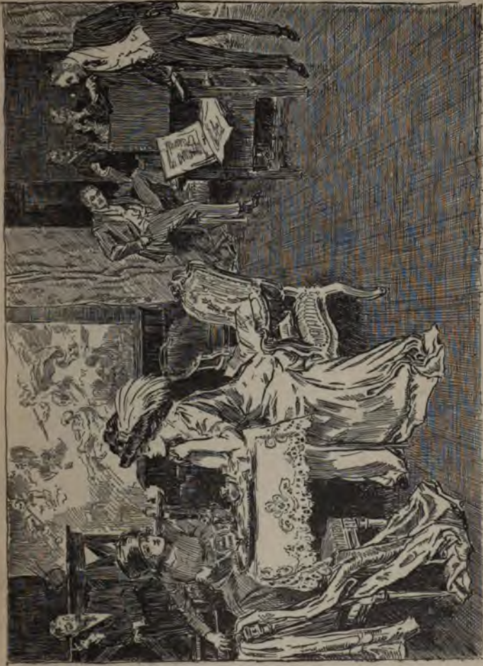
“Ogilvy stood looking sentimentally at the two young girls.”